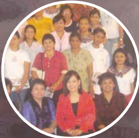
PRESIDENT'S DAY Pre-Graduation Conference