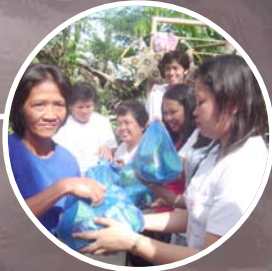
BIGAY-PUSO Lingap Center December 22, 2005