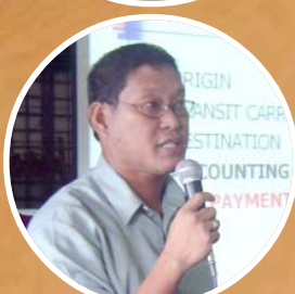
ALUMNI SPEAKERS' BUREAU International Settlement Accounting, 5S of Good Housekeeping