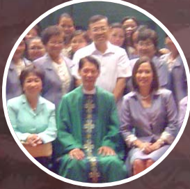
SUNDAY TV MASS ABS-CBN Channel 2 Studio August 21, 2005