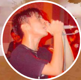
PAROKYA NI EDGAR @ Chill-out Party St. Theodore Hall, September 23, 2005