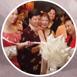
PEARL ANNIVERSARY DINNER The Bellevue Manila Hotel August 25, 2005